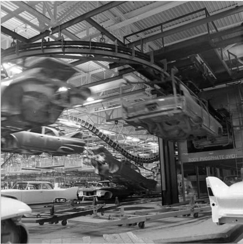
Pictured above is the assembly plant in 1959.

The Chrysler automobile plant opened in Fenton, Missouri during the 1950s and was in production until 2008.