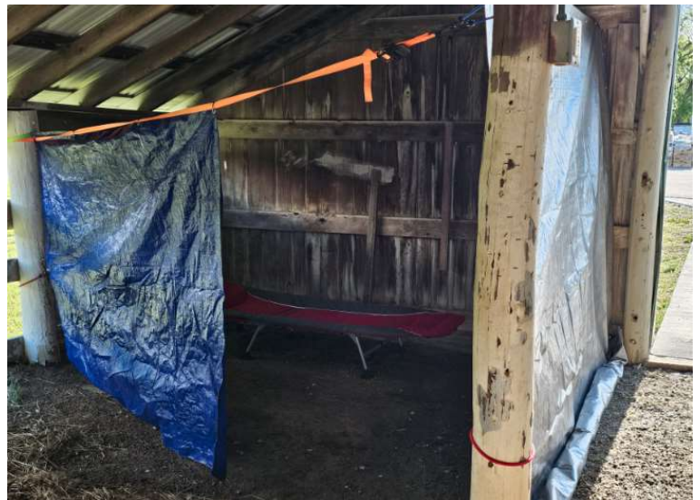
Pic 2: Mick's pad, the Taj Mahal. Ratchet straps and tarps set up as wind breaks.