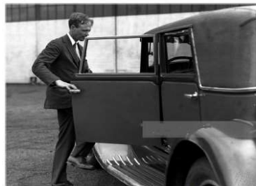
Charles Lindbergh 1932