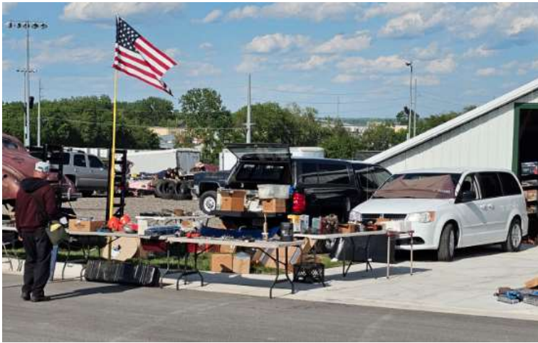
Pic 1: Weather was great, no rain or snow. Sold some things and bought some.