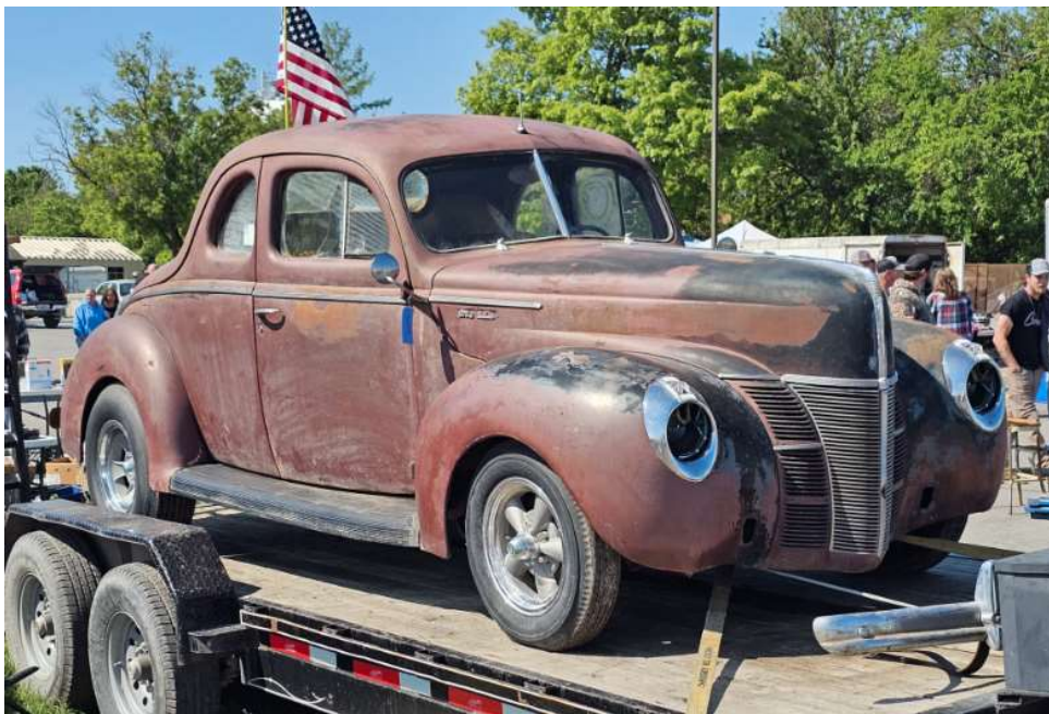
Pic 3: Mick's newest project was acquired from the space next to ours.