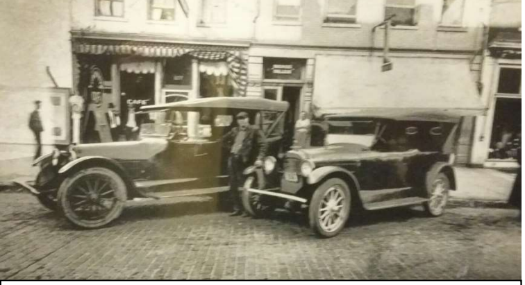
McKinney Brothers Café, currently Sweet Smoke BBQ, at 127 East High Street in JCMO.

Jefferson City's High Street facing east toward Madison Street. Central Bank is the tall building in the distance on the left.