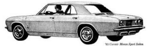
Corvair by Chevrolet

(Some of the things you don't get in a Corvair are among your best reasons for buying it.)