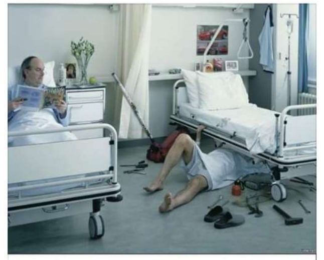
What happens when Old Car Guys get sent to a nursing home ...

As the year comes to an end, I urge you to take care of yourself and avoid accidents because spare parts for old models like you are no longer in stock. forward to other old models you care about.