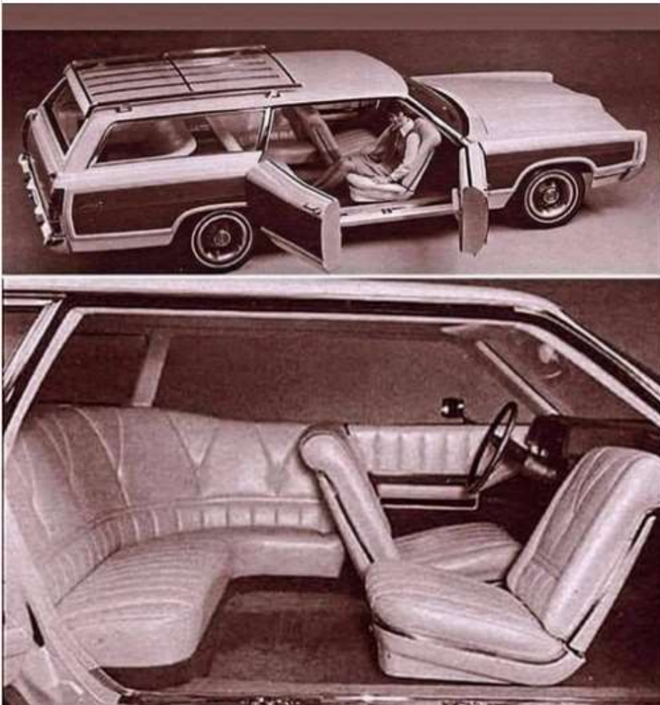
1970 Country Squire with leisure pit interior.