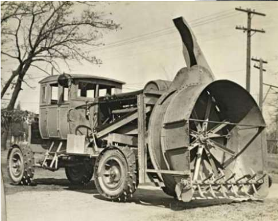
Snow removal equipment... get out of the damn way!