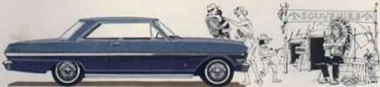
CHEVY II NOVA 400 SPORT COUPE