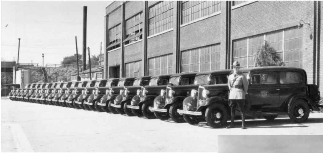
MSHP new fleet of Patrol Cars.