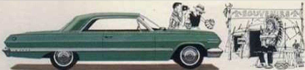
CHEVROLET IMPALA SPORT COUPE