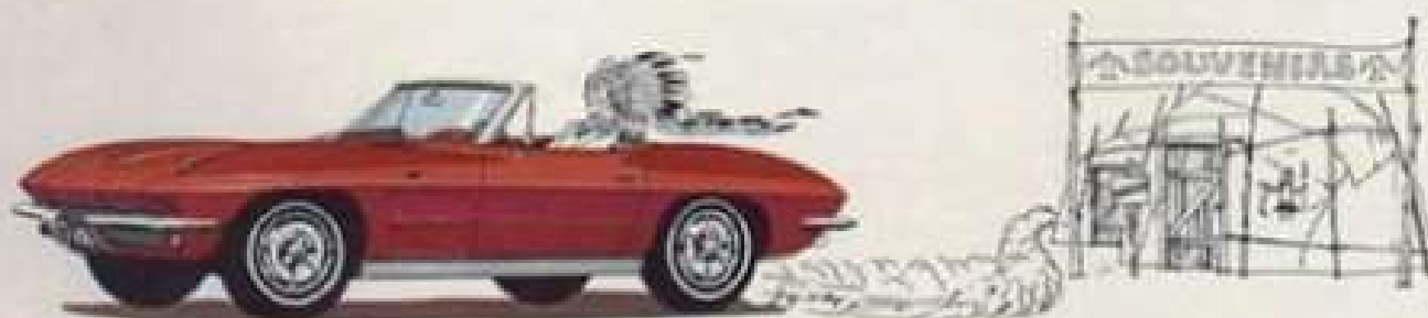
CORVETTE STING RAY CONVERTIBLE

car by instinct and a family car by choice; and for pure driving adventures, two all-new versions of America's only home-grown sports car, Corvair. Take your pick. If driving any one of them at your Chevrolet dealer's doesn't have you poring over road maps for plans to go, you'd probably rather spend your vacation just showing off around town! . . . Chevrolet Division of General Motors, Detroit 2, Michigan.