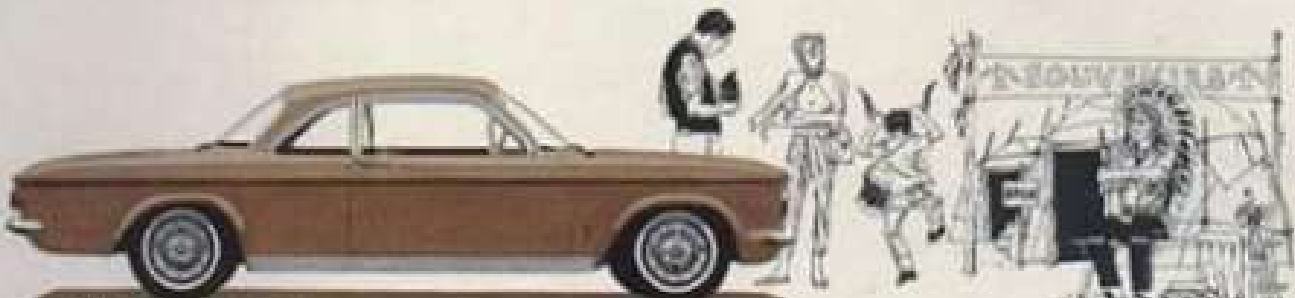
CORVAIR MONZA CLUB COUPE