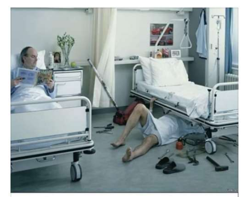
What happens when Old Car Guys get sent to a nursing home ...

PO Box 1594, PO Box 1594, Wid Mo Old Car Club