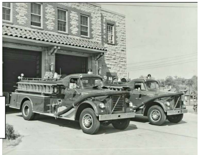
Jefferson City Fire Department 1957 – At the corner of what is now Missouri Blvd and Highway 50/63.