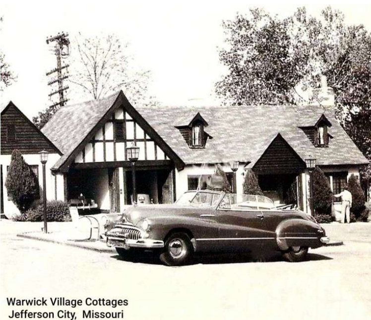
Warwick Village Cottages Jefferson City, Missouri