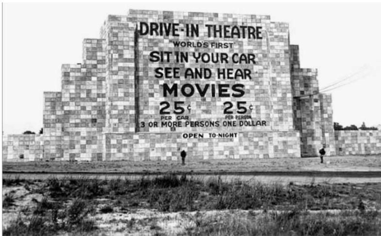
The reverse side of the world's first drive-in movie screen, in Camden, New Jersey.

of space is available for each car to come in or go out without including the length of the car itself. From the bumper of a car in Row A to the front bumper of the car in Row B is a fifty feet clearing space.