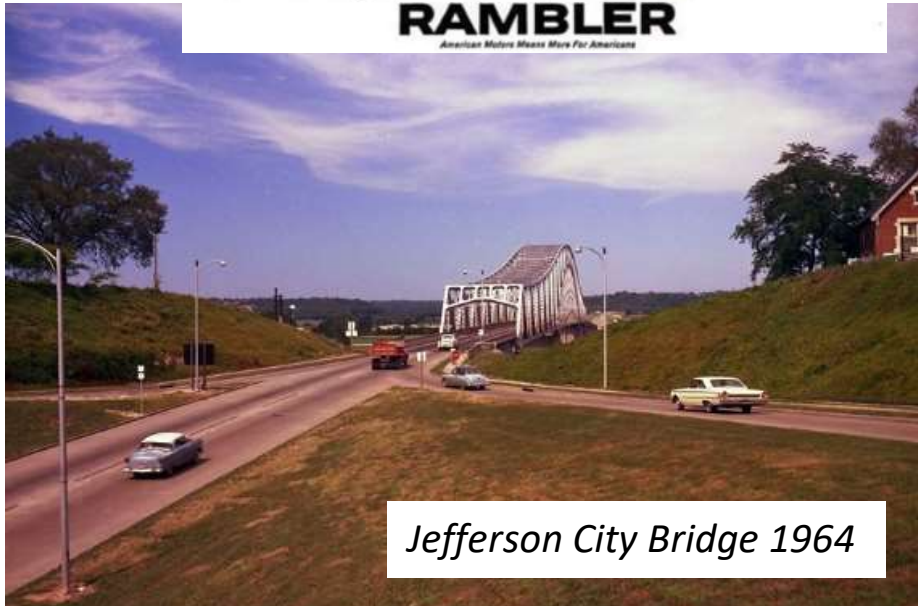
Jefferson City Bridge 1964