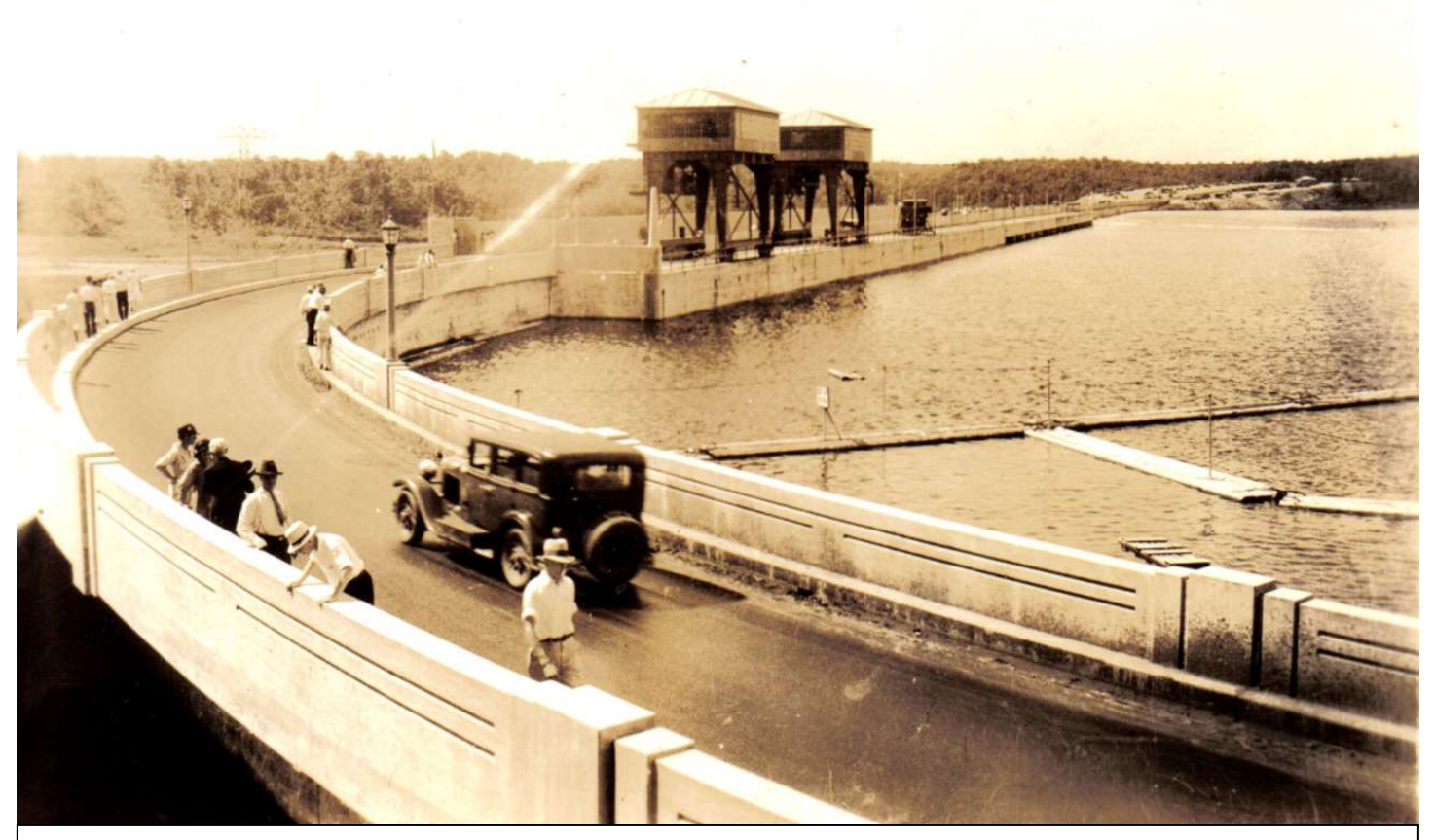
February 21, 1931 - The gates of the $33 million Union Electric Light and Power Company dam at Bagnell, Missouri were closed. The Osage River began forming the largest manmade lake in the world at that time, with a shoreline of 1,300 miles.