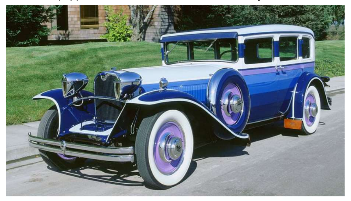
A 1930 Ruxton. As if the eye-grabbing paint job wasn't enough, the car is also equipped with Woodlites.

But while the E&Js are certainly distinctive, they can't touch Woodlites for outright weirdness. Love 'em or hate 'em, at least you'll seldom miss a pair when you walk by a car so equipped—and rest assured, that's exactly the effect the commissioner of a