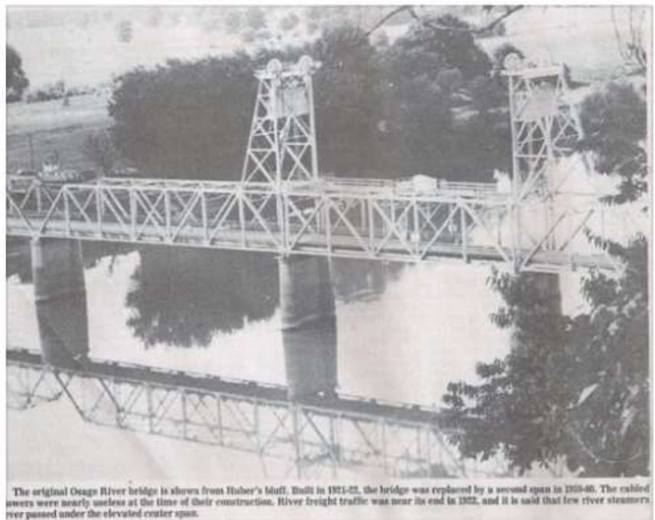
The original Osage River bridge is shown from Huber's bluff. Built in 1911-23, the bridge was replaced by a second span in 1950-60. The cathead towers were nearly useless at the time of their construction. River freight traffic was near its end in 1922, and it is said that few river steamers ever passed under the elevated center span.