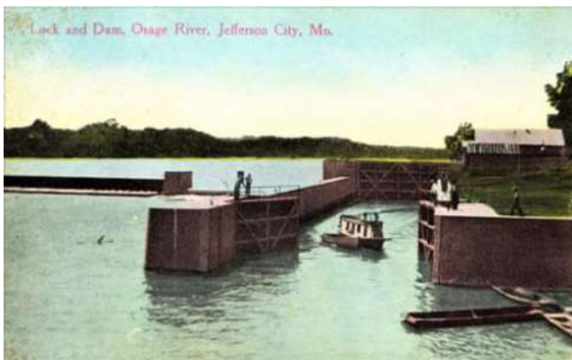
Lock and Dam, Osage River, Jefferson City, Mo.