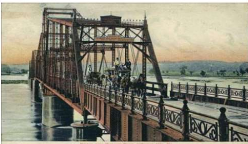
First bridge over the Missouri River at Jefferson City

Now, with these odd Social Distancing times, we all have to BRIDGE the divide that separates us. That can be done with