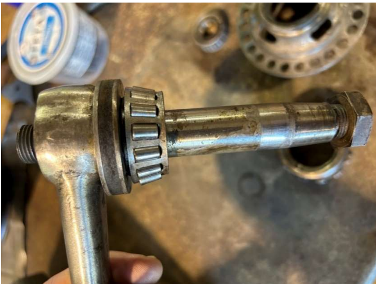
Caption: Pitman arm, washer, felt seal, bearing .