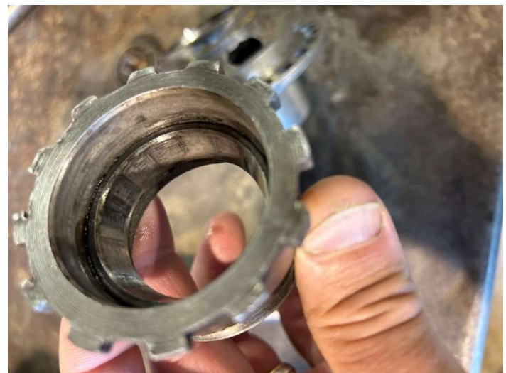
Caption: Bearing housing for backlash adjustment. Moving counter clockwise moves the race closer to the bearing on the pitman arm shaft while simultaneously taking up the endplay between the bearing and race on the other end of the shaft.