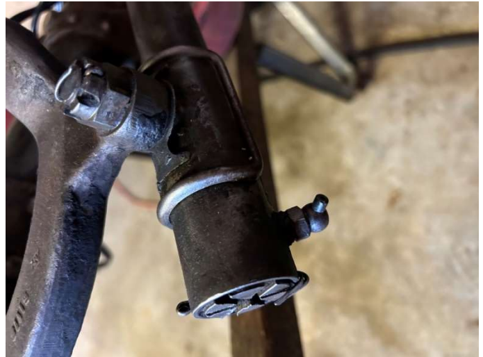
Caption: Tie rod assembly.