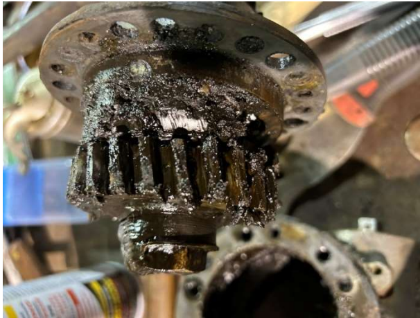
Caption: Steering gear bearing housing after cleaning. The multiple holes are drilled on an eccentric housing to allow for gear lash adjustment. Move the housing clockwise/counter clockwise relative to the steering box brings the steering gear and pinion gear closer together or further apart.