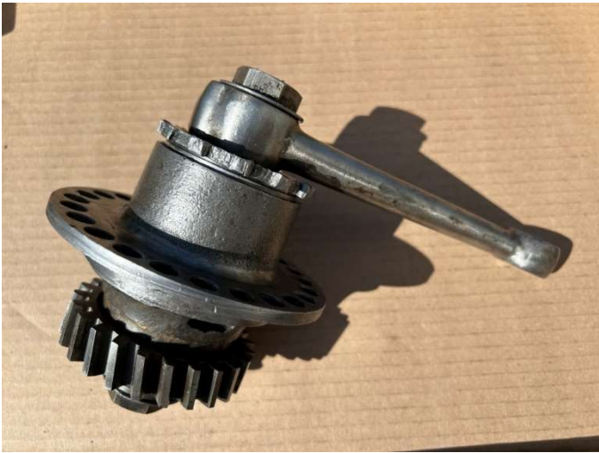
Caption: Steering gear and pitman arm reassembled and ready to torque nut and bend lock washer before assembling in the steering box.