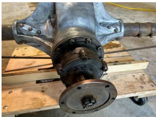
Caption: Rear differential and axle bearing assembly (after coarse cleaning). Note the aluminum differential carrier housing and steel axle