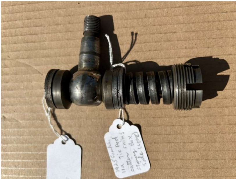
Caption: Ball joint assembly. Note: This is a serviceable assembly using a spring, shims and two concave bushings for cradling the ball stud, and threaded tension adjuster/retainer. Shims and bushings are drilled on center to allow grease to penetrate through to the ball stud.