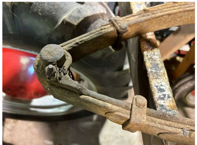
Caption: Spring shackle bolt (before cleaning)