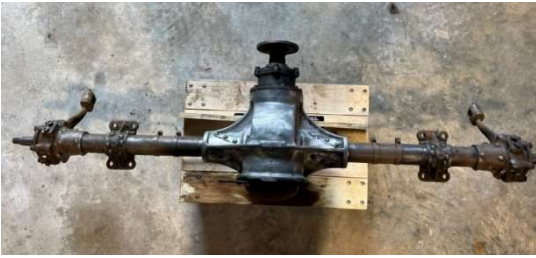
Caption: Drive shaft coupling and pinion gear housing. Note safety wire lacing bolts. Many bolts are drilled for safety wire on this car.