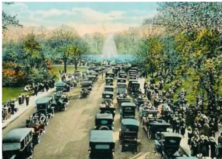
Packard factory parking yard, early 1900s,

Grand Drive in Forest Park in St. Louis, Missouri ca. 1917. Popular park on a Sunday afternoon for a promenade.