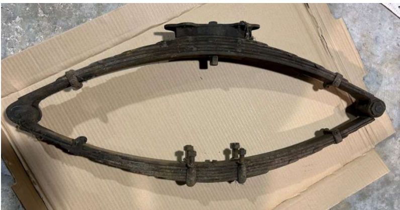
Caption: Front elliptical spring assembly (before cleaning), Note: wood shim to help set steering axis inclination at 3 degrees when mounted to the wood frame.

Next, I cleaned the front axle, steering knuckles and tie rod assembly. All of these components needed a good wire brushing and cleanup. The king pins are greased at both ends with a zerk fitting installed in an end cap at bushing housing. I disassembled the steel grease cap ends and cleaned out the hard grease and pumped new grease through. There was a little play when dry, but is better now that it's packed with grease.