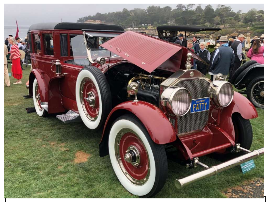
1923 McFarlan 154 Twin Valve Six Knickerbocker Cabriolet