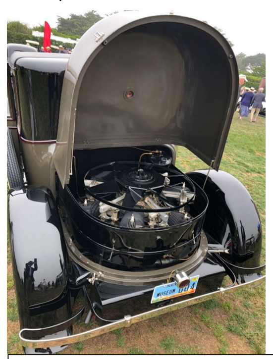
1925 Julian Fleetwood Sport Coupe, Radial Engine in the rear (prototype, never mass produced)