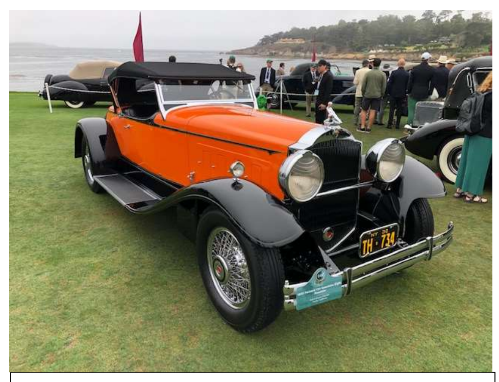
1930 Packard 734 Speedster Eight Roadster