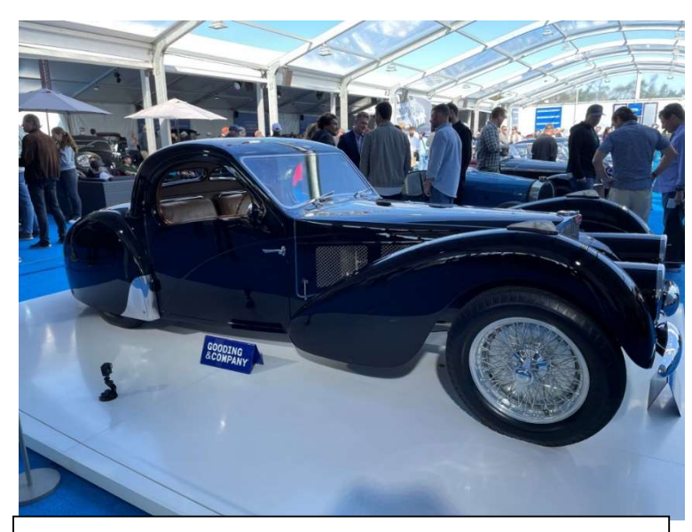
1937 Bugatti Type 57SC Atalante (note oil leak drip just behind the front right wheel)

Another staple of the Pebble Beach Concours week is the annual Gooding Auto Action at which a variety of exotic, rare, and expensive vehicles are auctioned off to the highest bidder. The highest grossing vehicle was 1937 Bugatti Type 57SC Atalante. Anticipated to bring over $10 Million the sale gaveled in at just over that amount. The Bugatti was very nice with voluptuously sculpted coach work. Although I did notice there was an oil leak as it sat on the display platform which goes to show no matter how expensive the car there will always be something that needs fixing.