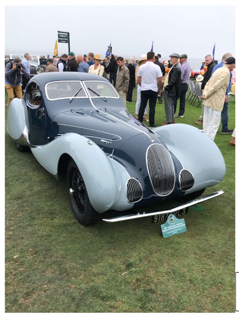
1937 Talbot-Lago T150CSS, Figoni & Falaschi Teardrop Coupe