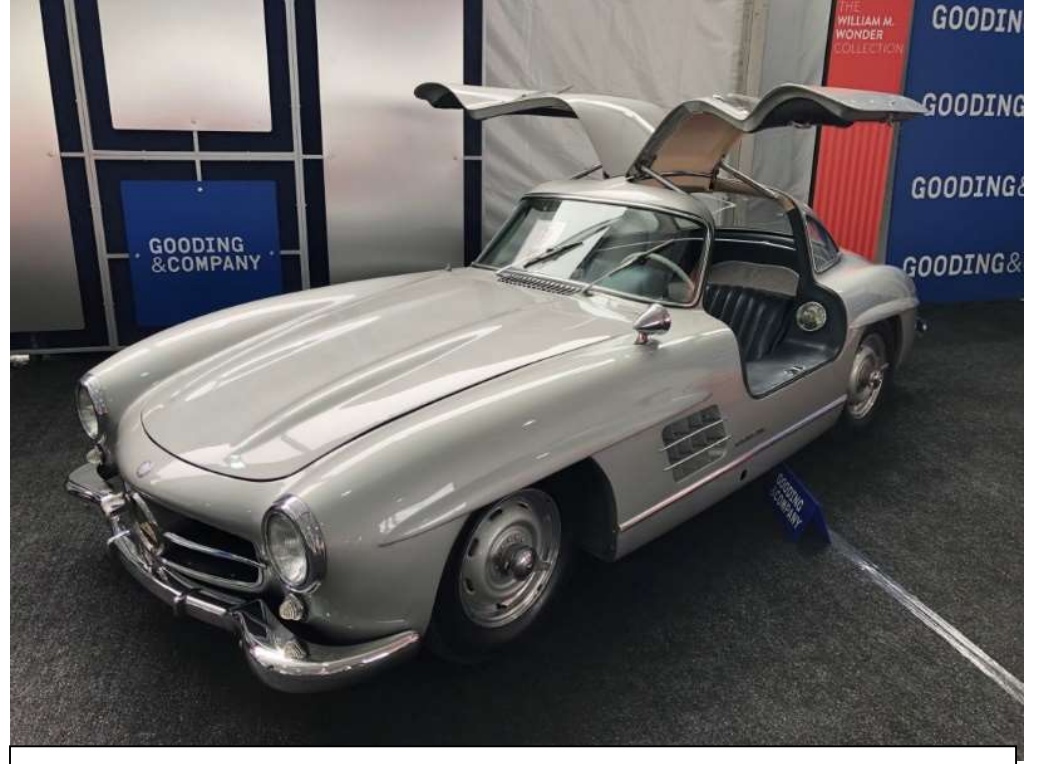
Mercedes-Benz 300SL Gullwing roadster

Jamie's favorites were the Mercedes-Benz. A silver 1957 300SL Gullwing roadster and 1937 Mercedes-Benz 540K Sport Cabriolet A. Each of these vehicles estimate to sell at over $1 and $2 million respectively. There were two nice Auburn Boattail Speedsters: 1932 12-160A and 1936 852 SC and Several Packards that I would not mind having in my stable.