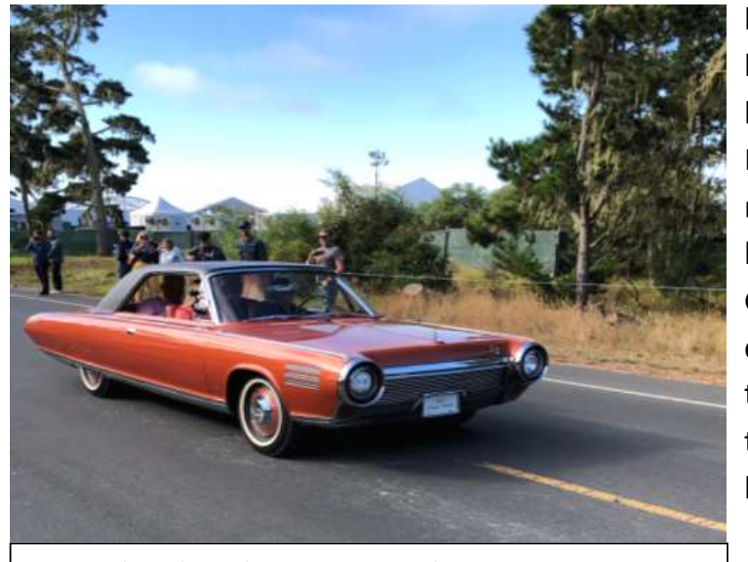
1963 Chrysler Ghia Coupe Turbine

gasoline powered engine started by foot cranking power. It was working, but I think it may