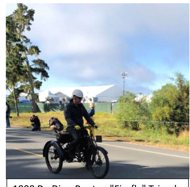
1900 De Dion Bouton "Firefly" Tricycle

There are a number of activities in advance of the Concours one of which is the Tour D'Elegance, which was held on Thursday, August 18th. The tour consists of vehicles that will be judged in the Concours on Sunday. It's an opportunity to see many rare and significant cars moving under their own power. Vehicles that tie for best of show judging can break a tie if one of the vehicles participate in the Tour D'Elegance and the other didn't. One of the oldest rides was a 1900 De Dion Bouton "Firefly" tricycle with a 2 & 3/4 horsepower single cylinder