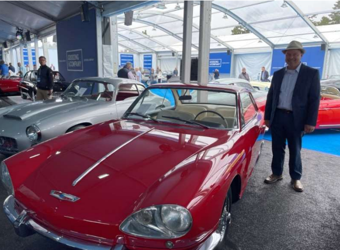
Me with the Pina Farina Corvair (one-off concept car-1960 but updated three times. 1963 version is its current form)