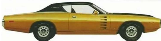
DODGE CHARGER RALLYE COUPE 1972