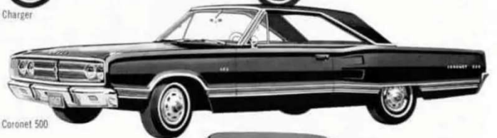
'67 Dodge Coronet 500