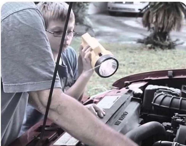
When your helping dad fix the car to learn but all you learned was how to hold a flashlight and get yelled at