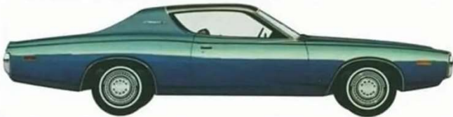
DODGE CHARGER HARDTOP 1972