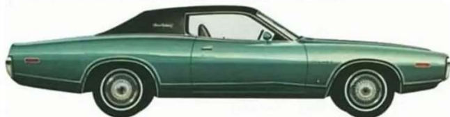
DODGE CHARGER SE 1972