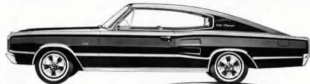
'67 Dodge Charger