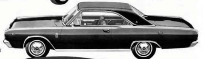
'67 Dodge Dart GT