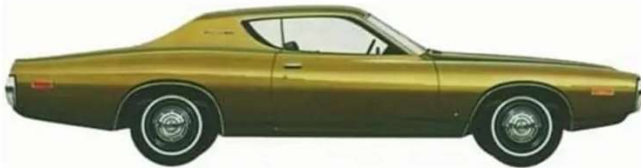
DODGE CHARGER COUPE 1972