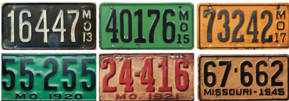
The format and color scheme in Missouri changed over the years. For the first 37 years of license plate existence in Missouri (1911 – 1948), a new plate was designed every year. They were pretty basic, but had a different color every year.

was designed every year. They were pretty basic, but had a different color every year.