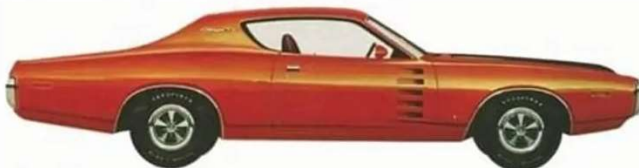
DODGE CHARGER RALLYE 1972