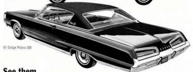
'67 Dodge Polara 500