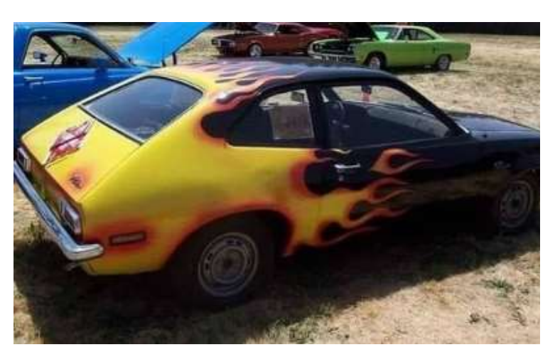
Remember your PINTO history and you will get the joke.

Jafferson City, MD 65102 PO Box 1594, Mid Mo-Did Car Clid-