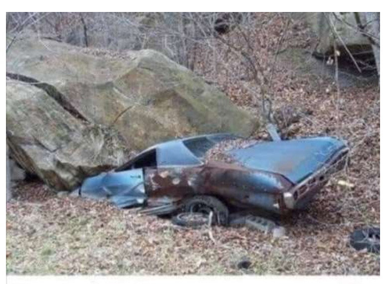
For Sale: Chevy with Big block