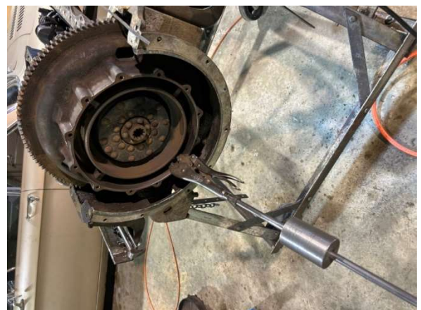
Caption: Pulling thrust ring out of flywheel housing.

applications and heat I was able to free the pressure plate assembly but sacrificed a spring that holds the steel pressure plate friction disk retracted when the clutch is released. With the pressure plate assembly out, I could access the pressure plate friction ring and centralizers. With a little heat (Wes's rosebud torch) and Wes's vice grip slide hammer tool I was able to slowly and carefully pull, little-by-little, each of the four centralizers with the puller symmetrically moving the puller to each of the centralizers until the assembly pulled out. Nothing broke which was good since where can you find parts?!?