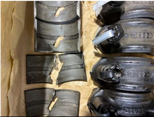
Caption: Main bearings. Note damage to upper babbitt bearing shells due to the weakness of the oil gallery relief.

concentrically around for the oil gallery that feeds oil to the connecting rod journals through a rifle bored port in the crankshaft between the main and rod journals. Franklin cut the relief in the upper main bearing long enough so that during assembly a person could not install the bearing inserts backward and block the oil supply. This is good from an foolproof manufacturing assembly design perspective, but the long relief left only about 0.150" of babbitt bearing over most of the length of the bearing leaving the bearing susceptible to breakage over long term abuse from crankshaft vibrations. I