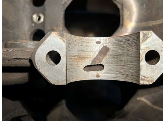
Caption: Upper crankcase main bearing cradle. Note offset oil gallery port and oil staining behind where the bearing oil passage relief is cast in the bearing shell.

noticed in the Franklin drawing for the insert bearing in change "O", Franklin removed the relief on the back side of the bearing on November 30, 1928, presumably realizing the design flaw. The change incorporated a note indicating consult assembly instructions for repairs (presumably a note that instructed the service person to install the relief so the oil gallery hole lines up and is not installed backward and block the oil supply since the design change would mean the bearing can only be installed one way and work correctly!)