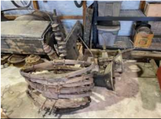
Caption: Various Franklin parts: Leaf springs, rear trunk, crank shaft, clutches, flywheels, two transmissions, rear fenders...

25.3 horse power 6 cylinder air cooled engine with 3-1/4" bore and 4" stroke. Crankshaft main and rod journals are 2" diameter. At first I thought I might be able to free the engine cylinders by soaking liberally in penetrating fluid. That proved fruitless so I decided to start taking the cylinders off one-by-one to see which was hanging things up from rotating. Franklin cylinders of this model are made of one casting (a true 'jug' no separate cylinder head which has advantages and disadvantages). The major advantage is no possibility of 'head gasket' leaks. The major disadvantage is if the piston is stuck you have to