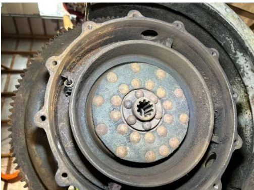
Caption: Clutch thrust ring in flywheel housing- Note the four centralizers rusted to the flywheel housing and broken release spring.

Now that I realized the crank had to come out, it was time to start working on removing the clutch from the flywheel which is necessary to obtain access to the bolts that hold the flywheel on the crankshaft. The flywheel has to be removed to access the bolts that fasten the rear main aluminum labyrinth style oil seal half castings to the block. Franklin used a Brown-Lipe 'pull' release type clutch design where the pressure plate assembly slides into the cast flywheel housing. There are four precision hard cast steel centralizers that hold the pressure plate assembly true in the housing. The problem was... you guessed it... the four centralizer blocks were rusted to the flywheel housing and they are not accessible when assembled. Again, using the tried and true penetrating oil