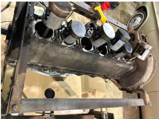
Caption: Air Cooled Engine, all cylinder assemblies removed

bearing caps and discovered the reason for the stuck crank... rust from years of condensation cycles had slowly grown to penetrate into the babbitt bearing surfaces preventing any chance of movement. Only slight pitting on the babbitt was evident though, so not so much of a problem. The real problem was that three of the inner 5 main bearings (7 total) were cracked on the upper half shells due to a design flaw in the oiling system. Franklins use an all aluminum crankcase that's cast in two halves. The upper half holds the crank and camshaft and the lower half is a solid cast aluminum oil pan with an integral sump, oil pump and oil gallery distribution system to cooper distribution lines. The main bearing caps are fastened by two long bolts that straddle the bearing cavities in the center of the crankshaft bore.