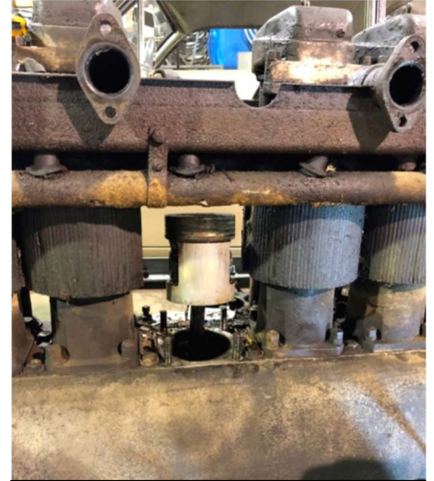
Caption: Franklin Air Cooled Engine, one cylinder jug removed.