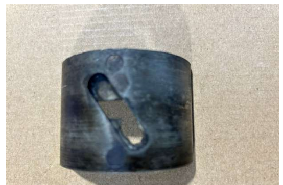
Caption: Center main bearing-solid babbitt (die cast). Note: Oil gallery relief 'cut/cast' diagonally on the back side to allow oil from the oil gallery supply in the crankcase at the edge of the bearing to the center of the bearing.

The issue Franklin faced was the oil gallery could not be drilled directly on center to the bearing or it would interfere with the bolts that secure the lower main bearing caps, so Franklin drilled the oil gallery offset to the side of the bearing cradle bore. Franklin designed a relief on the back side of the upper babbitt bearing 5/16" wide at 35 degrees diagonal to direct oil to the center of the bearing where there is an oil groove cut