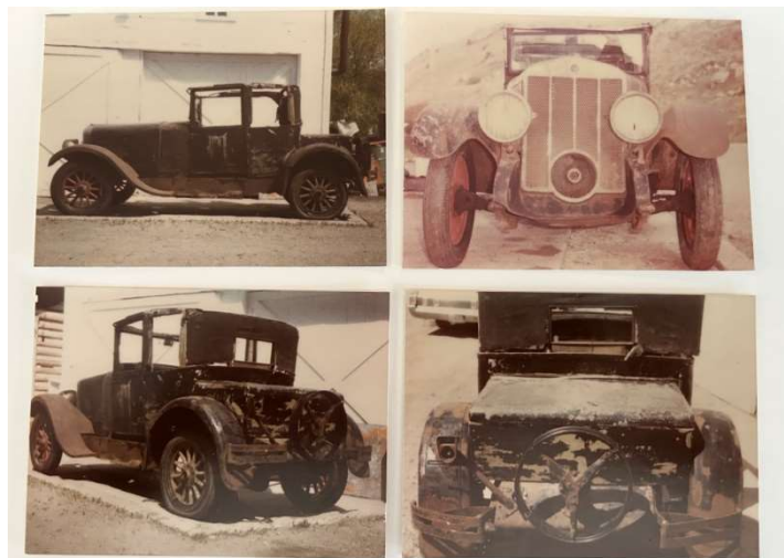
Caption: 1925 Franklin 11A, Babcock Bodied Coupe (pictures circa 1979 before it was disassembled)

The car is completely disassembled with many parts in 30+ boxes and numerous larger parts, wheels, tires, steering assemblies, cowls, fenders, full elliptical leaf springs, multiple crankshafts, camshafts, wood sills, headlamps and more! Wes and Jack Boswell helped move all the parts to my place in one trip one weekend using Wes's F150, car hauler, My Chevy Silverado, and Jack's Ford F250. I told Wes after we unloaded it all if I knew there was that much stuff I might have decided