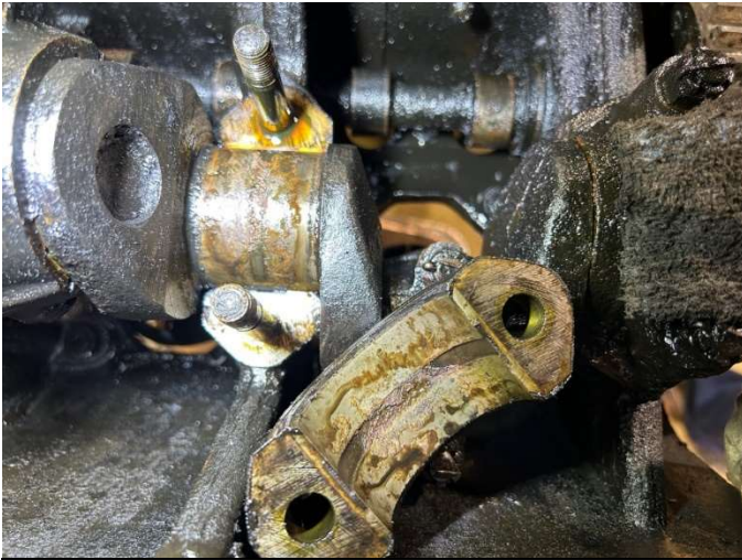
Caption: Years of condensation cycles rusted the surface of all the main journals.

Now the crank was out it was time to work on the camshaft which, you guessed it, was stuck. Thinking most of the problem was with the oil pump drive gear and shaft which is driven by helical gear on the camshaft. I applied penetrating oil, employed back-and-fourth rocking and eventually freed things enough to get the oil pump gear and shaft out. The camshaft still would not turn much so I decided to pull it and the bearings out. The camshaft bearings are designed to come out with the camshaft which actually turns out to have been good in this case, since less damage to the camshaft bearings would occur in the typical situation where you pull a camshaft through a set of tapered bearing inserts. I applied heat to the aluminum block casting around the aluminum cam bearings to expand the aluminum casting which made removal with a slide hammer much easier and