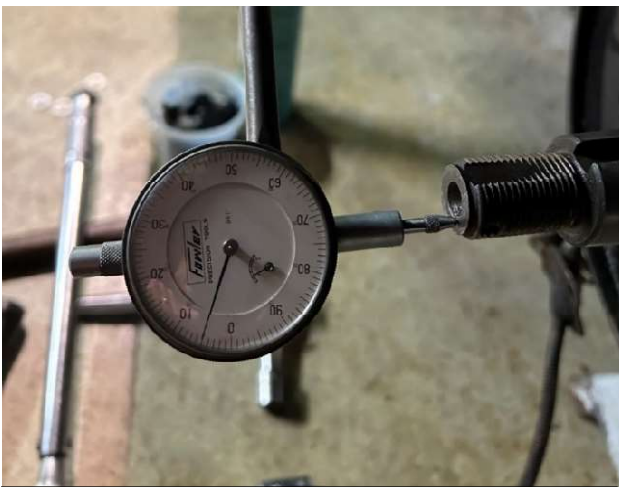
Dial gage indicating endplay value when moving the shaft out from zero lash. (in the final case 0.005" endplay) Packard specification: 0.004"-0.007".