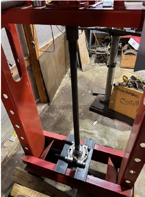
Pressing in the new axle bearing