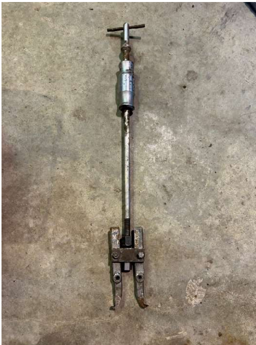
Improvised slide hammer seal puller tool

used 0.007" from Kanter Auto Products which brought the final endplay to 0.005" which is in the factory specification range. From there it was a matter of assembling the brake pads, installing the drums, and adjusting the brake shoe clearances.