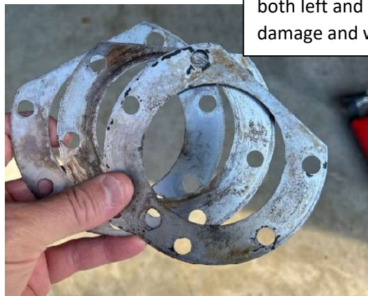
Shims used to set bearing endplay clearance with new bearings (used shims are now only available in 0.020" and 0.007".)