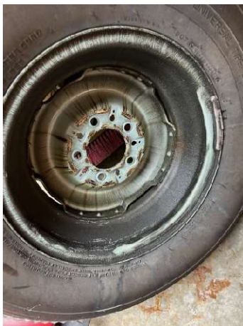
Rear wheel rims coated with axle oil. Both sides were similar. (This is not easy to clean)

I was hoping to reuse the bearing assembly, but I discovered there was damage on the bearing outer race which necessitated a replacement. Unfortunately, due to the effort involved, replacing bearings means the axle shaft endplay must be adjusted to tolerance to account for the finish dimensions of the new axle bearing assembly. The axle bearing is held in by the brake backing plate and shims are used between the baking plate and axle housing to make the adjustment. So, it was off to order bearings, brake shoes, and some used shims from Kanter Auto Products in NJ to help set the endplay as necessary along with the oil seals.