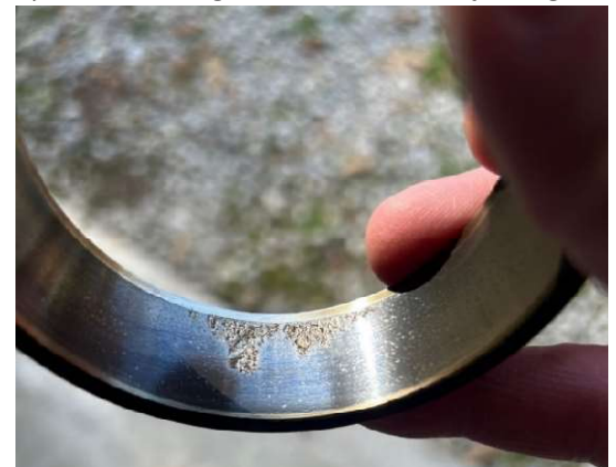
Bearing outer race showing damage, both left and right bearings had similar damage and wear.