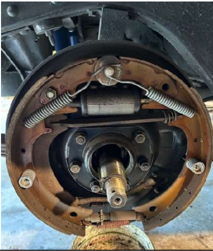
Brake shoes, cylinder axle shaft and braking plate. Note: The outer oil seal, this seal is relatively easy to replace.

Once the bearings were installed it was time to grease the bearings, install the shafts and adjust the endplay. There are six nuts that hold each one of the brake backing plates to the axle housing and shim stack that need to be snugged up very gradually and symmetrically to properly seat the bearing race in the axle housing bore. This operation can be time consuming to set, test, and remove to add or remove shims. To check the endplay and obtain an accurate reading, the bearing races need to be properly seated against the brake backing plates. To accomplish this, I used a large hammer while protecting the axle nut threads and gave the axle a solid 'blow' to seat the bearing race on the opposite side of the car. Then moved to the opposite side of the car and gave another solid 'blow' to the other axle back in the other direction to be sure the other race was seated. Now the endplay measurement can be made. I started with the original shims present when the axles were removed but when taking up the clearance with the backing plate, I soon discovered the