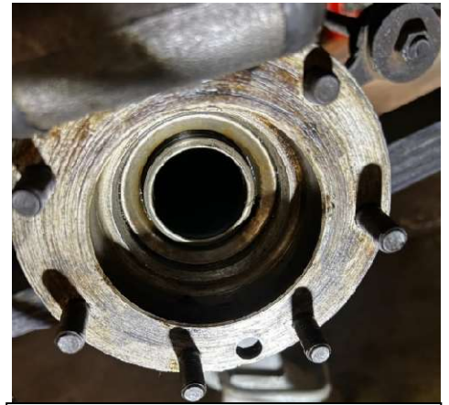
Inner axle oil seal assembly

assembly was too tight. I added another 0.020" shim to one side and that was not enough. I added another 0.020" shim to the other side to keep the axles centralized in the differential. This brought the endplay to about 0.003" which is just under the Packard specifications of 0.004"-0.007". There was one 0.005" shim from the original shim stack that I removed and put in the