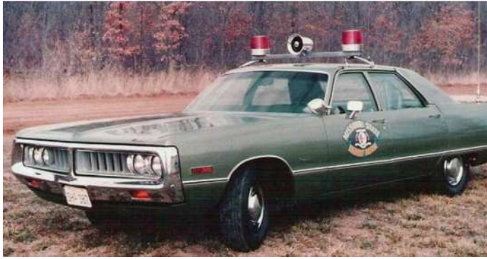
Missouri State Highway Patrol in 1972