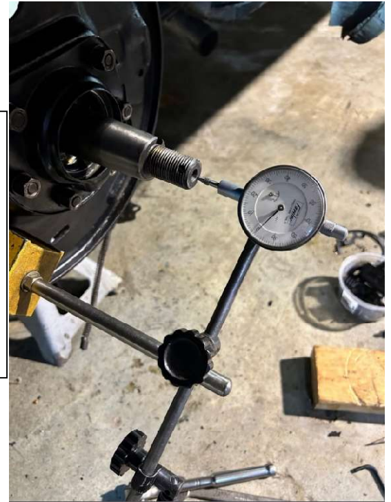
Measuring bearing endplay with a dial indicator. Set to zero after seating shafts to the opposite bearing race