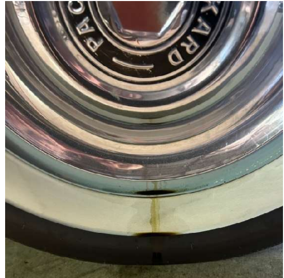
Axle oil leaking onto the rim and tire

The Packard rear brake drum and hub assembly is an integral component that mounts on a tapered axle shaft; removal mandates the use of a 'dog bone' puller and a little persuasion. There are two independent axle shafts, left and right side, and both splined ends of the axles meet at a centralizing block in the center of the differential assembly. Once the brake drum hub assembly is removed, the brake cylinder, parking brake cable, and backing plate must be removed to extract the axle and bearing assembly. To remove the axle, I improvised a slide hammer and puller plate and attached it to the axle. After a few raps with the slide hammer and the axle and bearing assembly pulled out of the axle housing without trouble.