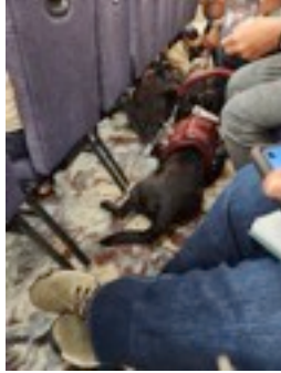
Mobility Service dog at the conference in Texas

Did you know it takes anywhere from eight months to two years to train a service dog? It all depends on how much training the dog may already have as well as what tasks are required for a persons disability. Once a dog learns these tasks, the trainer must