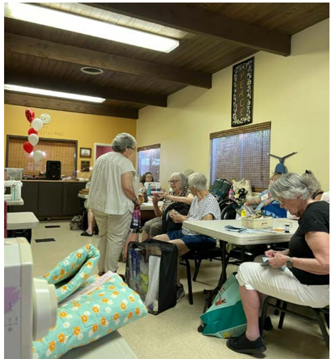
Community Service Sew Day 2024

Our June meeting is the most important time to wear your name tag since we will be mixing and mingling as we work for Community Service (word is we may be making pillow cases!). Plus, it's a great time to introduce yourself to a member you haven't met yet, especially our new members! Also, since there may not be any other drawings, you can count on the name tag drawing! WEAR YOUR NAME TAG AS YOU ENTER AND SIGN A TICKET TO WIN A PRIZE!!!