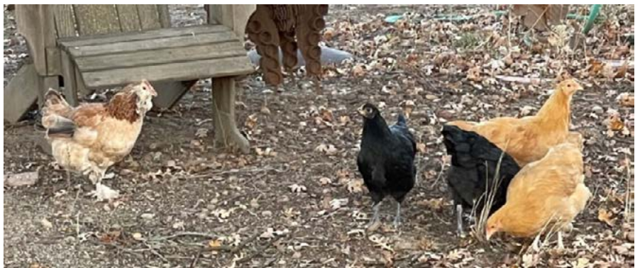
Lucky is watching the "youngsters".

By the time you read this the four "littles" will be the size of the other hens and therefore referred to as the "youngsters" or the "foursome", as they always stick together! For a while they were all cramming into one nest at night to roost, but now a couple are beginning to roost on the bars with the others. The other sign of their maturity is they no longer are peeping, but are now clucking!! And yes, they still fly/run to my lap for their afternoon apple! I am looking forward to when they begin earning their keep and laying eggs!