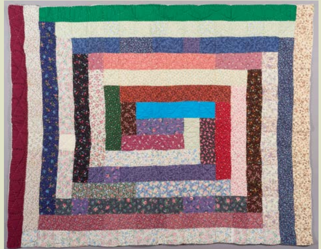
Log Cabin Quilt Anacostia Community Museum Artist: Ira Blount