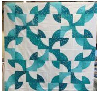
Modern Journey Quilt Pattern

This is a rare SATURDAY workshop to be held February 8, which should be convenient for members who are still holding down jobs. Many of you saw her quilt sample at our November meeting, but I am including a photo for those who missed it. The workshop roster is filling up fast, and the Sew Mates Studio where this workshop will be held is limited to an enrollment of 12. Please contact one of us if you are interested. Once 12 are enrolled, we can start a wait list.