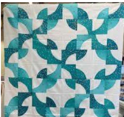
Modern Journey Quilt Pattern