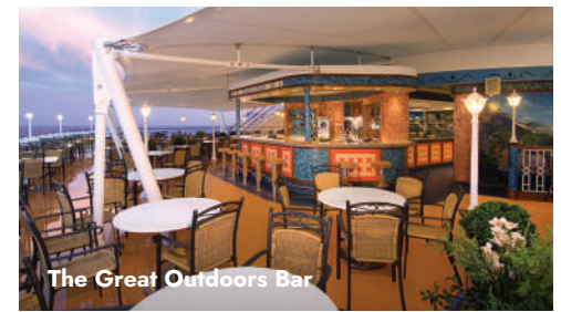
The Great Outdoors Bar

Sip on a refreshing beer at this bustling open-air buffet.