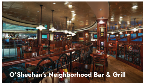
O'Sheehan's Neighborhood Bar & Grill

Try a few of the many beers on tap, catch a game on the two-story TV screen or play some billiards or darts. Seating capacity 196.