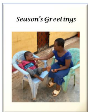
£15 Gift Card

To purchase cards or to find out more information, drop us an email at contact.FOAT@gmail.com . Below are images of the 2025 Amani Christmas cards.