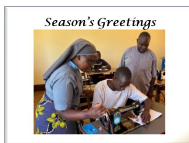
£25 Gift Card