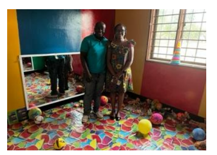
Baby sensory room