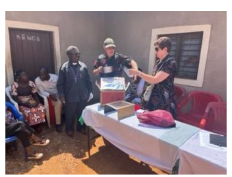
The concept of solar cooking