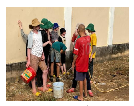
Filling buckets to water fruit trees on the new Shamba

The challenge of water supply still remains. There is potential for water capture from gutters and tanks on buildings on the edge of the site at a cost of £1,150 and the school has identified a location for a deep well on the new site, cost £2,500 but lacks funds for either of these projects.