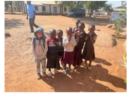
Children from the Compassion Nursery School