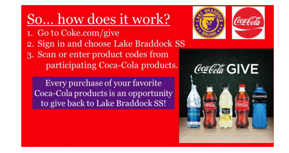
We have earned $72.42 so far!

Lake Braddock SS is excited to participate in the