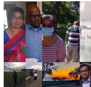
Hela Sarana Exco and supporting members walking for charity