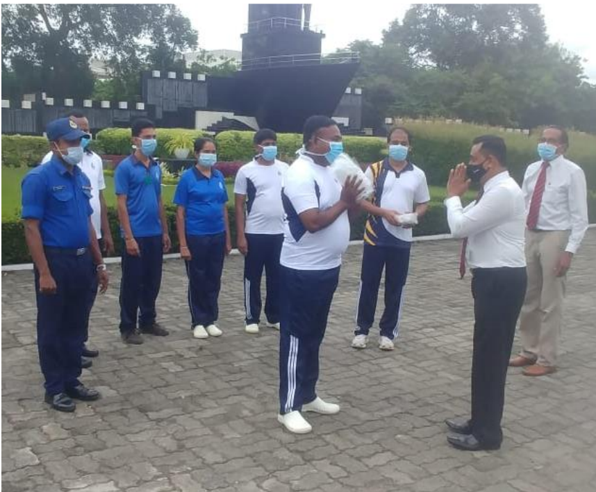
May 2020 - APSL UK and Hela Sarana (UK) donated 300 KN 95 respirator masks to the Sri Lanka Navy General Hospital, Welisara