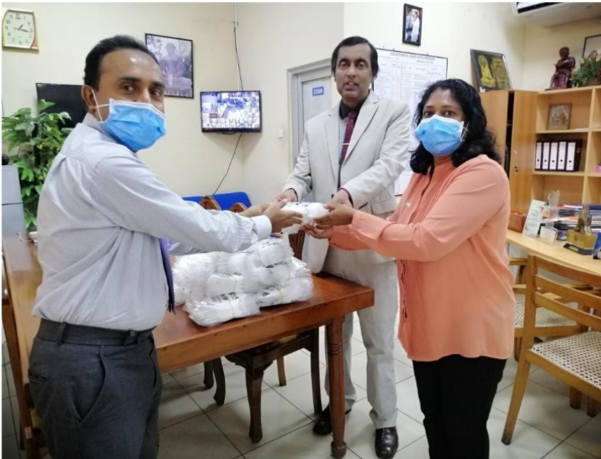
May 2020 - APSL UK and Hela Sarana (UK) donated 300 x KN 95 respirator masks to the Apeksha Cancer Hospital, Maharagama