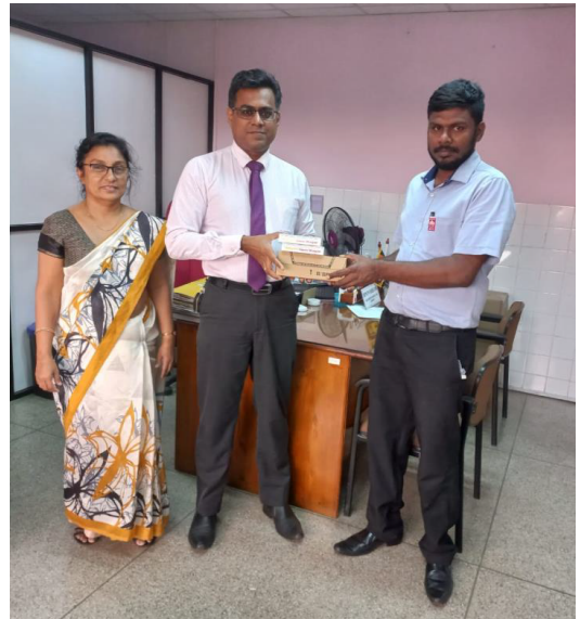
SUPPLY OF RESPIRATORY MEDICINE