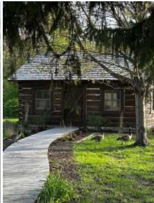
Daron Kinzinger took these spring photographs on April 26.