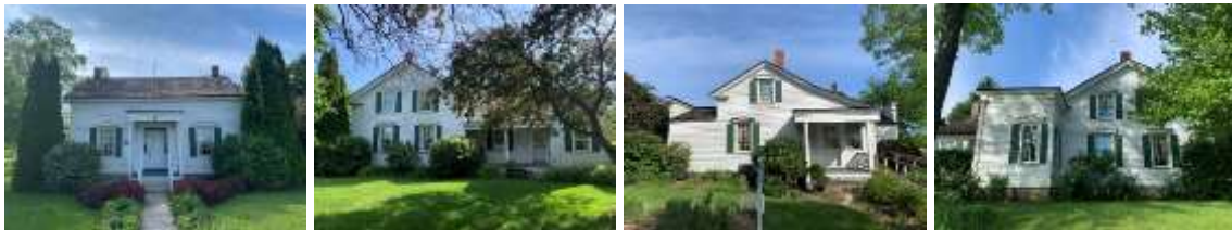
Four views of Letourneau Home/Museum's trees and bushes--views from left to right: north, west, south, and east.

https://us02web.zoom.us/j/82600273863?pwd=mDFDAHrYWaB8YQYWpxubGZaNNs1XY3.1 with passcode 800707 and meeting ID 82600273863.