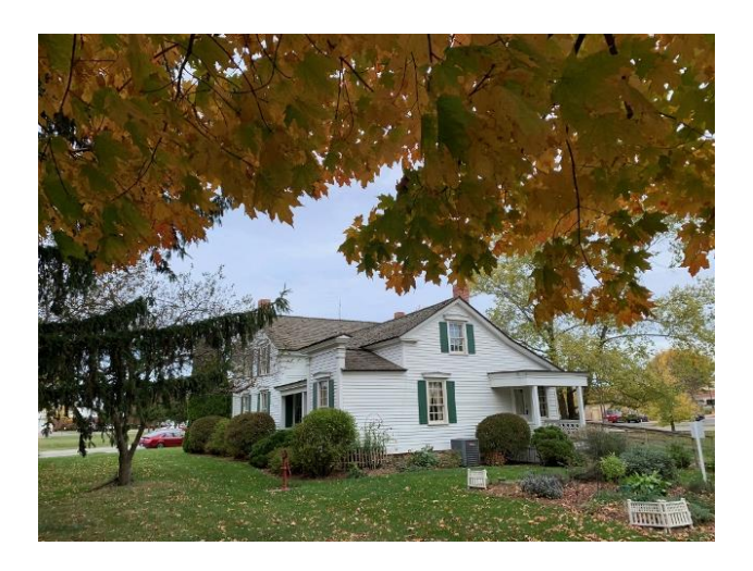
LLI Course Potawatomi Peril on Zoom this Friday 10/23/20

As the autumn colors drape the Letourneau Home/Museum historic landmark, there are several upcoming fall activities that you can safely participate in.