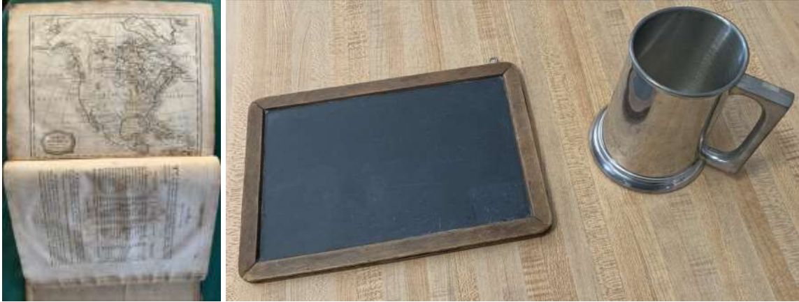
Pictured: 1807 General View of the World book and early 1800s slate tablet used by students to practice writing letters and numbers.

Do you have items that date back to the 1800s that you want to be showcased in Bourbonnais Grove's soon-to-be-rebuilt log schoolhouse? The BGHS is looking for: