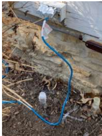
Pictured: foundation sump pump hose and blue extension cord for pump plug-in at back of Letourneau Home/Museum.