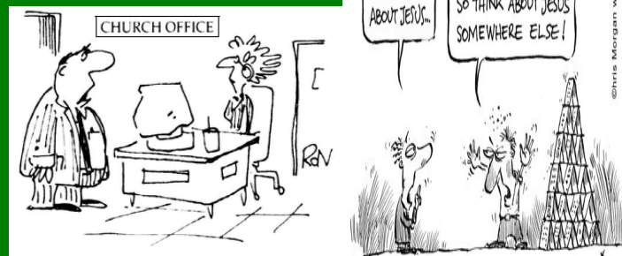
"If telemarketers call, invite them to church."

To bring a little levity during this difficult time, this space will be featuring light-hearted church humor. Hopefully we can bring you a chuckle.