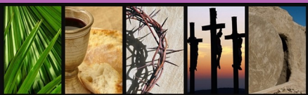
It's Holy Week! Rev Day