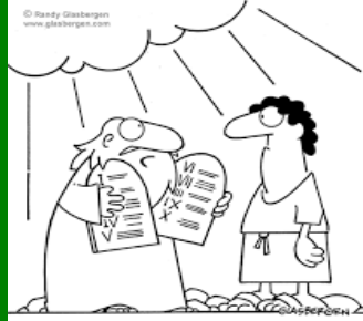
"I downloaded them from a cloud."

To bring a little levity during this difficult time, this space will be featuring light-hearted church humor. Hopefully we can bring you a chuckle.