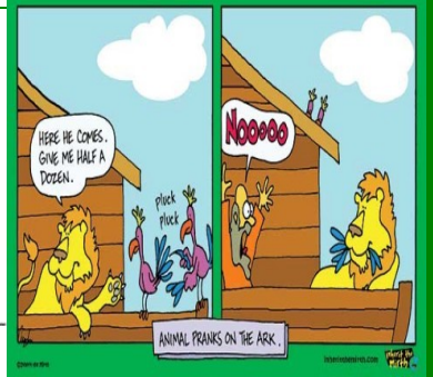
ANIMAL PRANKS ON THE ARK

To bring a little levity during this difficult time, this space will be featuring light-hearted church humor. Hopefully we can bring you a chuckle.