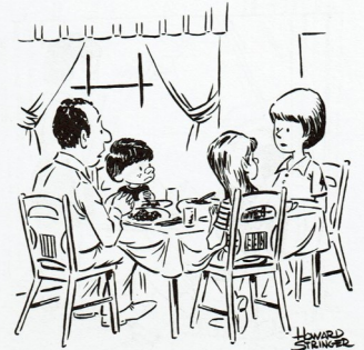
"I DON'T MEAN TO COMPLAIN ABOUT 'LEFTOVERS'. BUT I'VE ALREADY SAID GRACE FOR THIS MEAL THREE TIMES."

Sunday Funnies: To bring a little levity during this difficult time, this space will be featuring light-hearted church humor.