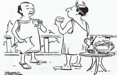
"TRUST ME, CAESAR... THIS CHRISTIANITY THING IS JUST A FAD. HERE TODAY, GONE TOMORROW."