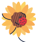
Ladybug Caregiver Program

Welcome to our new caregiver program called Ladybug Caregiver Program. We chose the ladybug as it represents protection, healing, and love. We also chose the sunflower as it symbolizes loyalty, friendship, long life, and strength, many attributes of a caregiver.