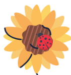
Ladybug Caregiver Program

We have a new caregiver program called Ladybug Caregiver Program. We chose the ladybug as it represents protection, healing, and love. We also chose the sunflower as it symbolizes loyalty, friendship, long life, and strength, many attributes of a caregiver.