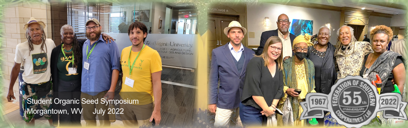
Student Organic Seed Symposium Morgantown, WV July 2022