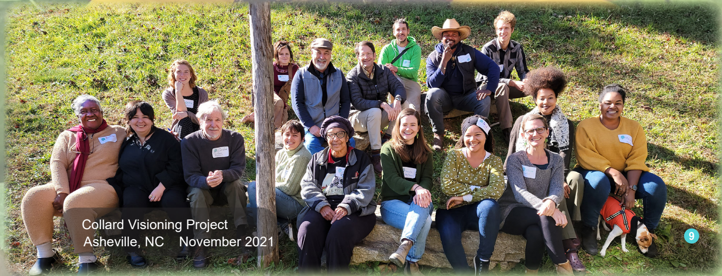
Collard Visioning Project Asheville, NC November 2021