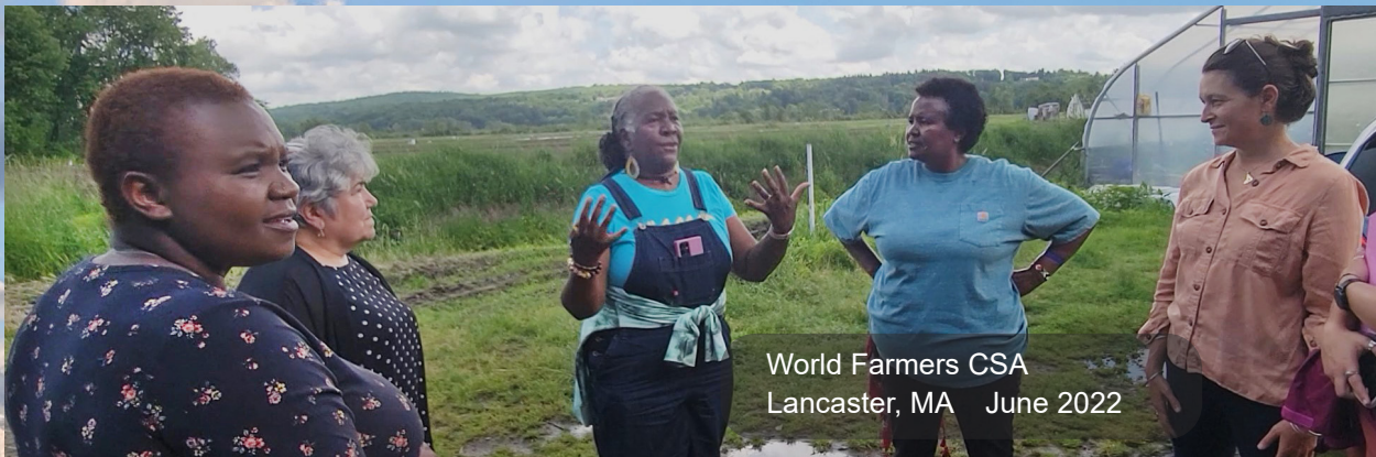
World Farmers CSA Lancaster, MA June 2022