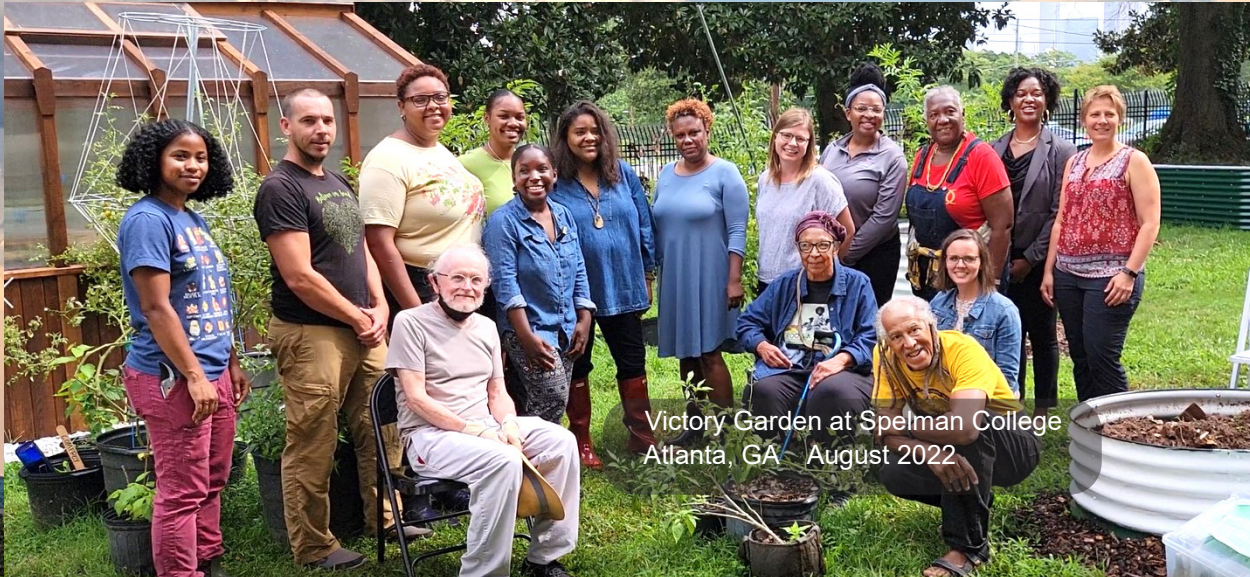
Victory Garden at Spelman College Atlanta, GA August 2022