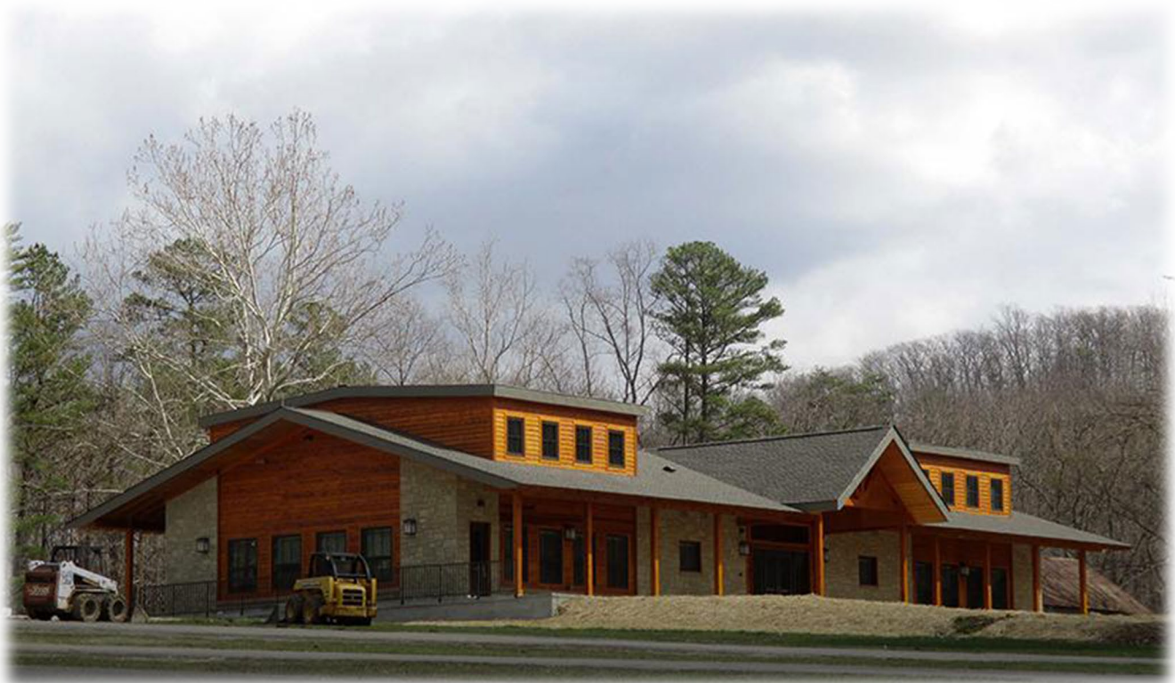
Berea College Forestry Outreach Center (FOC) 2047 Big Hill Rd, Berea, KY 40403