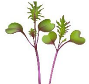
red russian kale