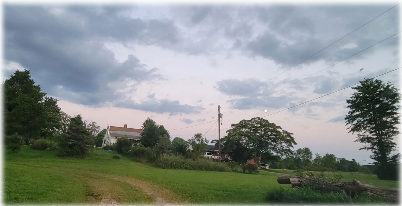
Atrus Ballew Farm