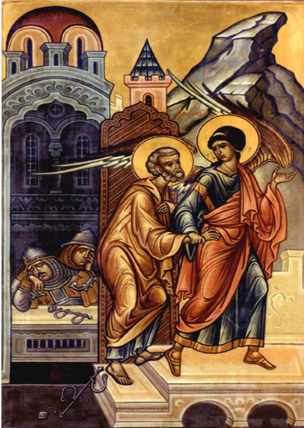
"Peter Released from Prison"