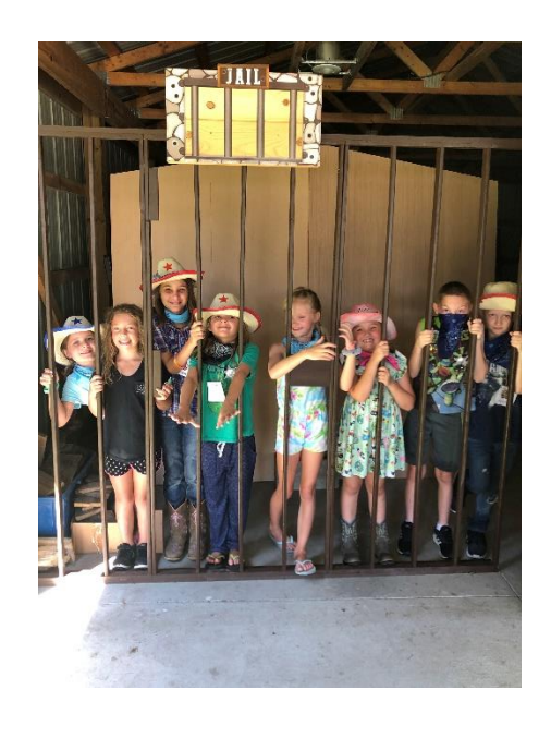
The Children had their picture taken in the YEE-HAW Jail..

What good things do you have in your lives? Friends, a loving Family, loyal pets, and a God who loves you.