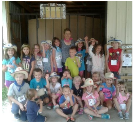
At the end of two days the kids were given goodie backpack bags and those soft, cuddly blankets...