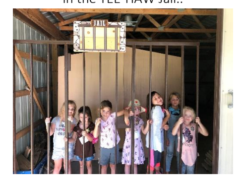
Which appeared great fun to them