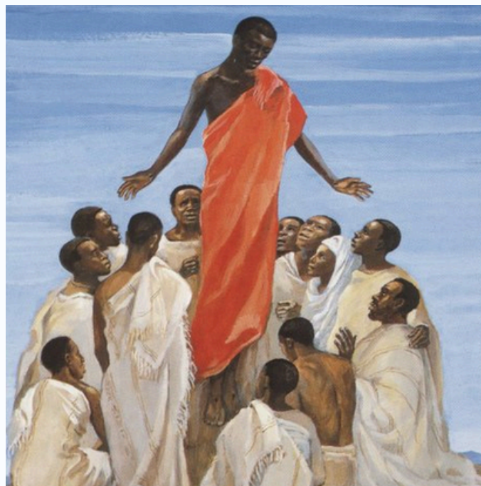
Jesus Mafa: The Ascension ©