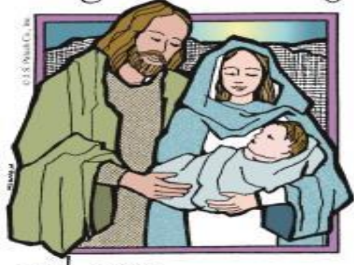
and was filled with wisdom