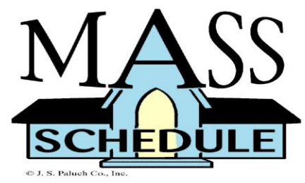
Must wear mask at all times – to attend.

Call 816-471-3696 or email:stmonica1616kc@hotmail.com