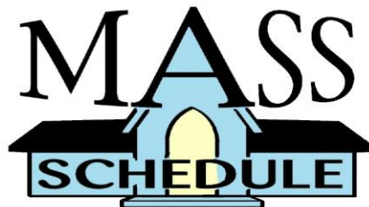
© J. S. Paluch Co., Inc.

Call 816-471-3696 or email: stmonica1616kc@hotmail.com