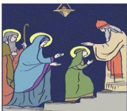
Presentation of the Blessed Virgin Mary